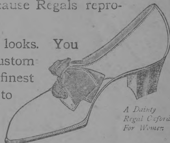
A Dainty Regal Oxford For Women